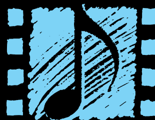
THE GUILD OF CANADIAN FILM COMPOSERS

The schedule of weekend PDP courses with Bursaries (50% tuition discounts) for members of participating organizations will be announced in Jan/08. An easy to complete online survey of courses being considered is available till Dec. 31 at pdpsurvey.harrisinstitute.com